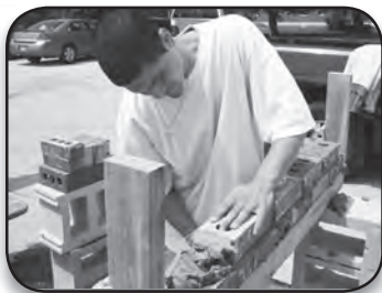
Trainee learns bricklaying skills on the job site

Since opening its doors, YouthBuild Lake County has brought 243 young people from poverty, illiteracy and even crime to a place where training and education come hand in hand with self-esteem, self-reliance and hope for a better life.