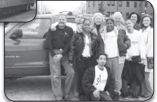
Newly donated vehicle from the Sinclairs