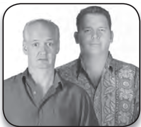
Colin Mochrie and Brad Sherwood

the work they were helping to fund. The benefit netted over $71,000, the most ever for our Spring Benefit. In 2010, the Spring Benefit will be in Chicago on Saturday May 1st with an Evening of Theater that will include tickets to the Tony-award winning play, Billy Elliott. Call now to reserve tickets and sponsorships as it is sure to be a sold-out event.