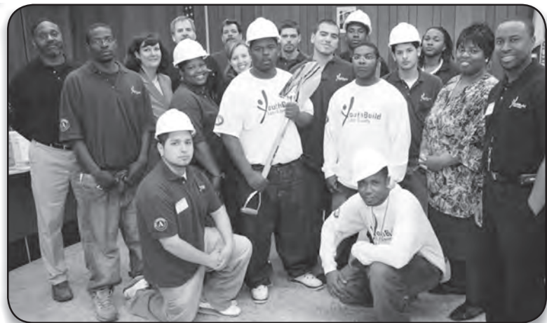
YouthBuild students and staff at the Green groundbreaking

Following green building practices will result in at least 30% lower heating, cooling, and electrical costs for the low income homeowners lucky enough to move into this 'groundbreaking' home in North Chicago.