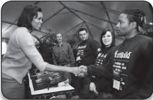
First Lady Michelle Obama meets with YouthBuild trainees