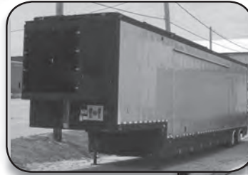
Discover Financial donates trailer

Financial donated a semi-trailer/moveable stage which will be used as portable event headquarters.