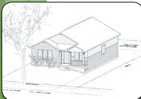
3D architectural drawing of the new green home

The YouthBuild Program continues to evolve and thrive thanks to the generous dedication of the Board of Directors, Coalition members, donors, staff and volunteers.