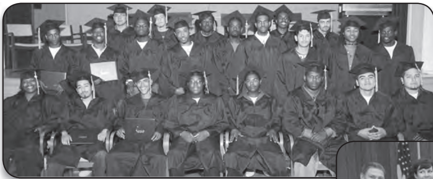
YouthBuild Lake County Graduating Class of 2009

Together, the trainees spent over 10,000 hours in construction and community service projects earning 23 graduates AmeriCorps scholarships worth $1250 each. Throughout the year trainees helped paint a school for autistic children, made lunches for the homeless, helped build parks, cleaned up streets in Lake County, attended speaking engagements, provided a panel discussion for a county-wide drop-out summit, and represented YBLC in local parades.