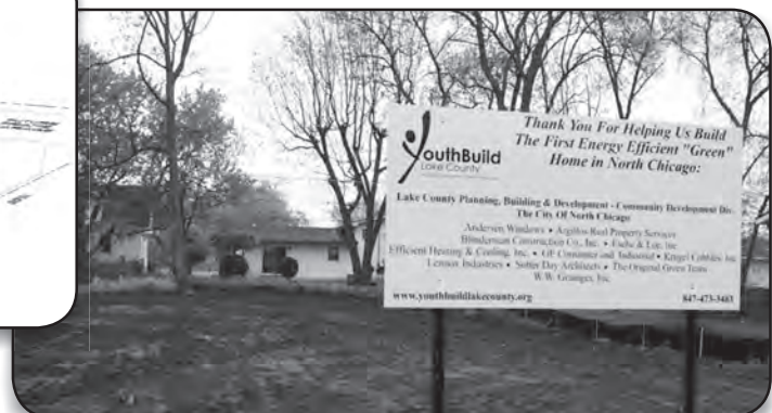
Site of YBLC's new Green Home